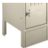
Front Base Enclosures