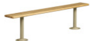
Benches 36" to 144"