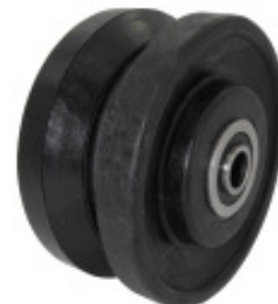
Glass Filled Nylon